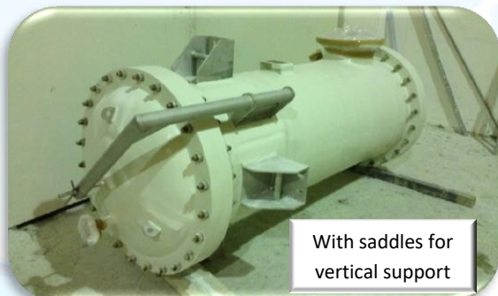
With saddles for vertical support