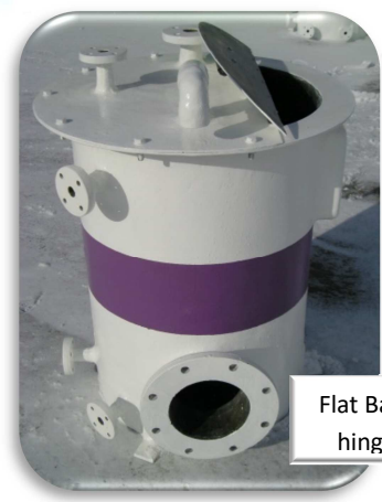
Flat Base and hinged lid