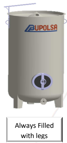
Always Filled with legs