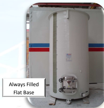
Always Filled Flat Base